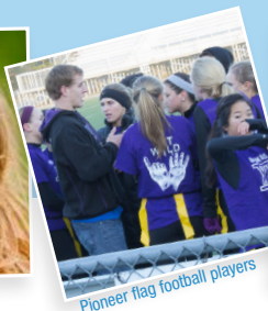
Pioneer flag football players